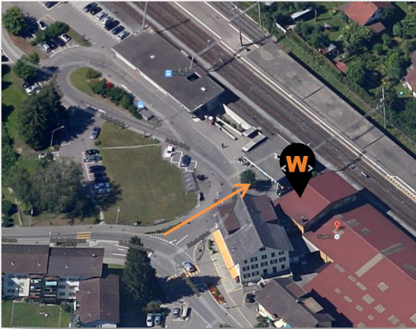
The property is located right next to the rail station Rümliang. The main entrance is next to the kiosk.