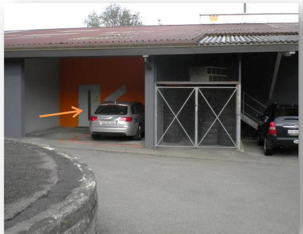
...or via side entrance and stairs...