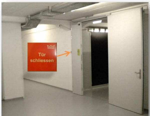
Please close fixed doors always by pressing the red button and not manually.