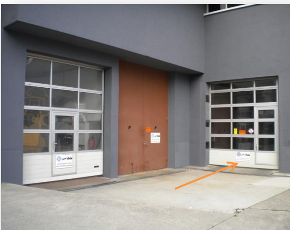
...or via garage and inside ramp.