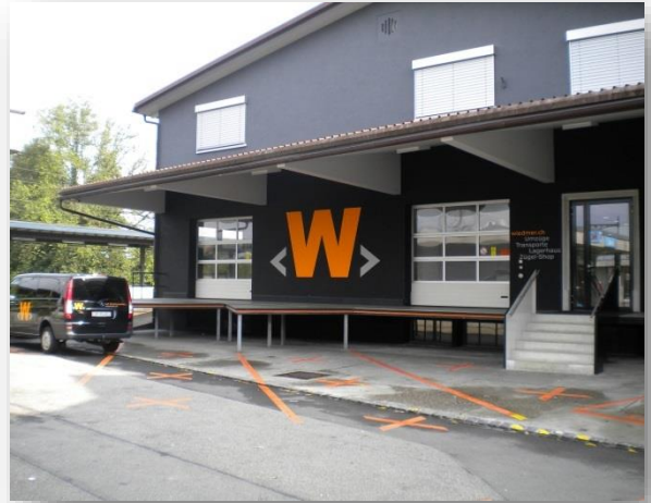
Visitor parking spaces are available in front of the main entrance.